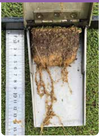
Dedicate Forte Stressgard