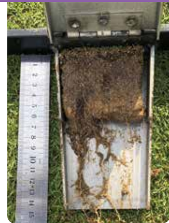
Dedicate Forte Stressgard + Banol + Indemnify