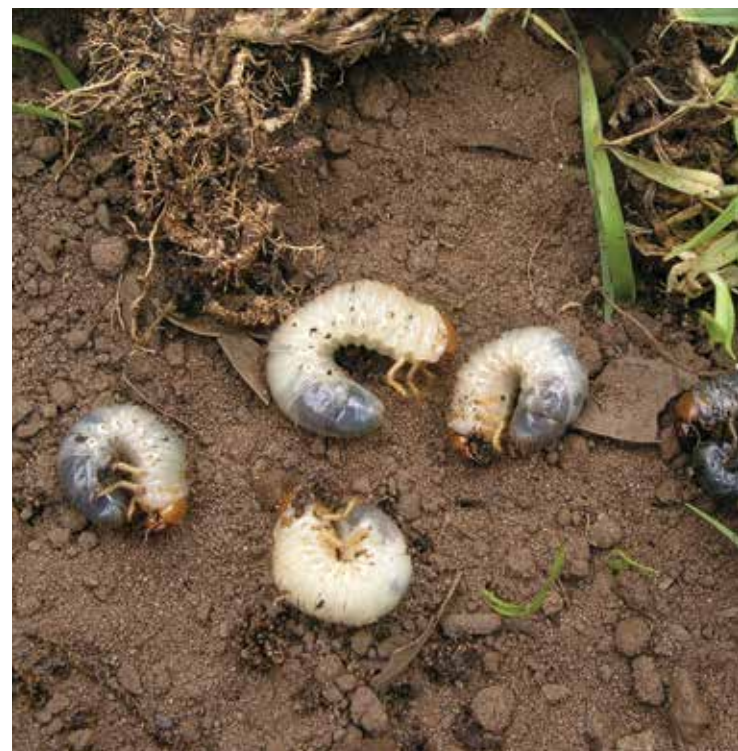
High density scarab larvae populations found beneath damaged turf.