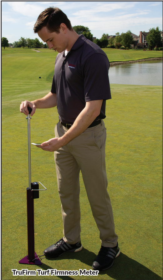
TruFirm Turf Firmness Meter