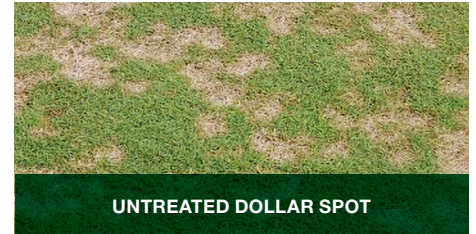
UNTREATED DOLLAR SPOT

For Winter Fusarium/Microdochium Patch control, use POSTERITY® as a rotation partner.