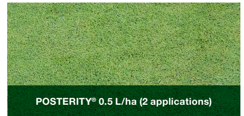
POSTERITY® 0.5 L/ha (2 applications)