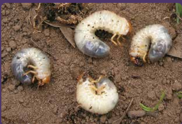
High density scarab larvae populations found beneath damaged turf.

Turf including golf courses, bowling greens, sports fields, race tracks, recreational lawns and turf farms.